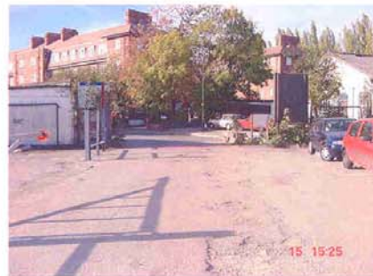
North End Rd - view exiting trading estate into North End Rd

The Police and the Emergency Services have been contacted regarding the proposals and they have raised no objections to the proposals.