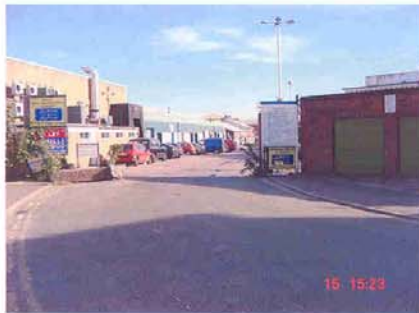
North End Rd – view of the entrance into trading estate

Following concerns raised by local residents regarding this potential problem in North End Road, the Council proposes to introduce a gated road closure at the end of the road at the point of access into the Wembley Business Centre. This will prevent through traffic and require access to the Trading Estate to be made via the Estate Access Corridor.