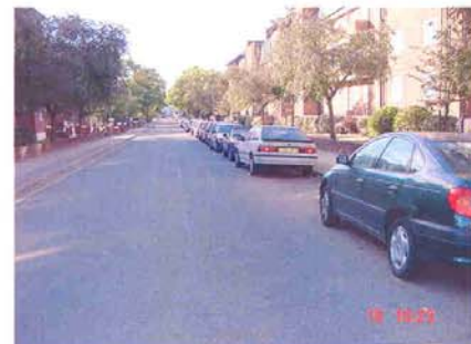
North End Rd – view towards the trading estate

Your views regarding the proposed road closure of North End Road are important to us therefore could you please complete and return the attached questionnaire using the pre paid envelope by Friday 28th November 2003.